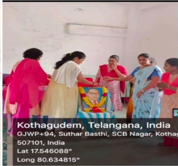
Kothagudem, Telangana, India GJWP+94, Suthar Basthi, SCB Nagar, Kothagudem, 507101, India Lat 17.546088° Long 80.634815°